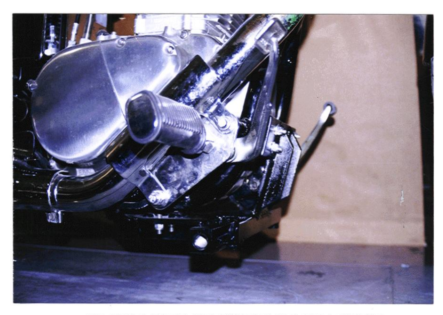
RIGHT SIDE VIEW BELLY BRACKET