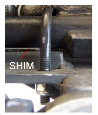
ILLUSTRATION OF SHIM PLACEMENT BRACKET PICTURED MAY NOT MATCH YOUR BRACKET

Place the shim in-between the rear belly bracket tab and the motorcycle frame.